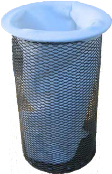
1 cu.ft. basket