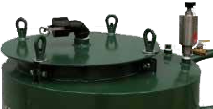
Air Venturi Suction/Discharge Feature